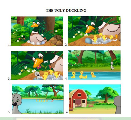
Figure 3.2 The Example of Post-Test