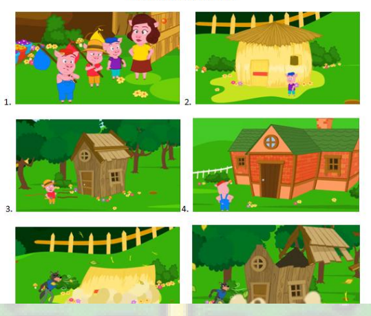
Figure 3.1 The Example of Pre-Test