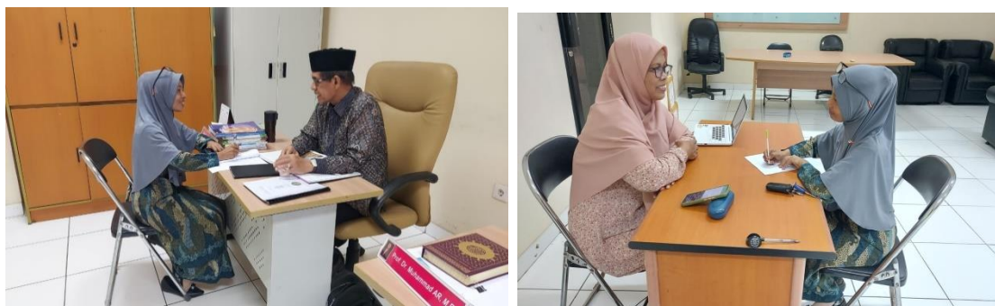
Picture 2. Interviews with PAI lecturers at UIN Ar Raniry Banda Aceh

maximum online learning strategies, so the lecturers did not understand proper learning strategies during the Covid-19 period for practical learning. Likewise students do not understand the online learning system, so learning how to use it while the lecture is in progress, especially for practical courses, he explains practical courses online: "The problem is students don't understand, because I teach practical courses..."