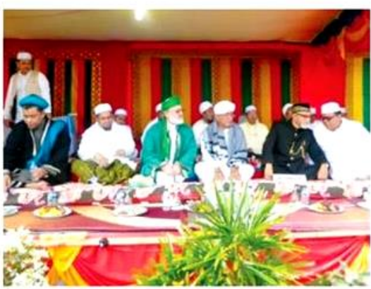
Muzakarrah ke-3 MPTT di Blanqpidie, Abdys.

Pertemuan para ulama ini menghadirkan pemateri dari Turki, Malaysia, Thailand, Brunai Darussalam,