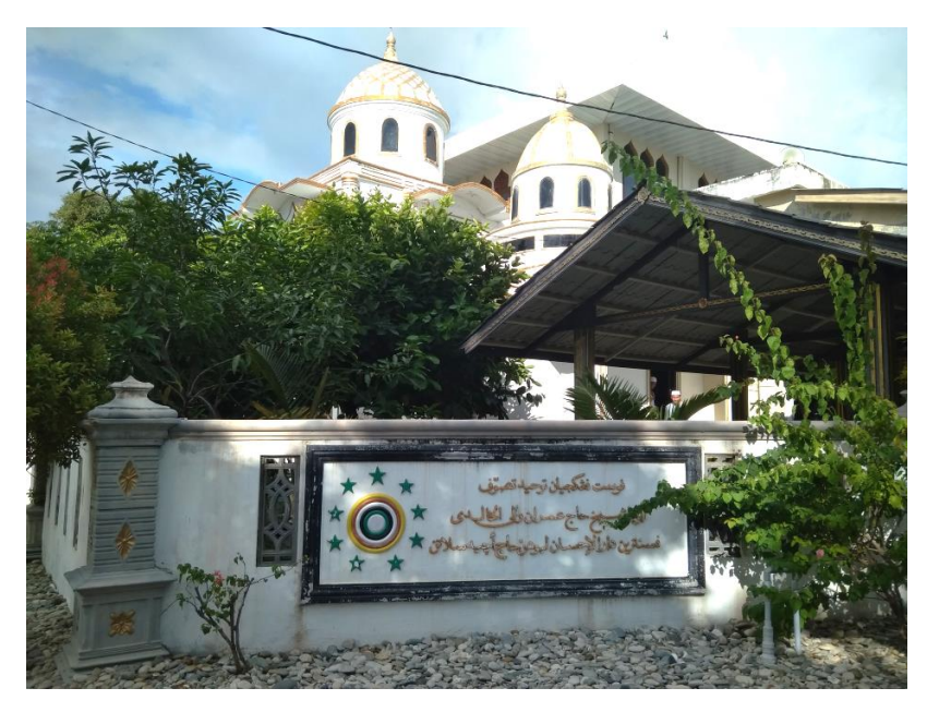
Picture 04. The Center for the Study of Tawhid Sufism in Pawoh, Labuhan Haji Tengah, South Aceh District