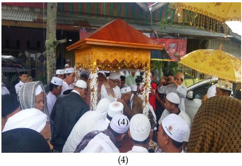
Kererangan: pada gambar (3) dan (4) Abuya Syekh Haji Amran Waly Al-Khalidi ditandu saat menghadiri Rateb Siribee di Aceh Jaya sebagai mufti besar dalam Tasawuf dan Pimpinan M.P.T.T