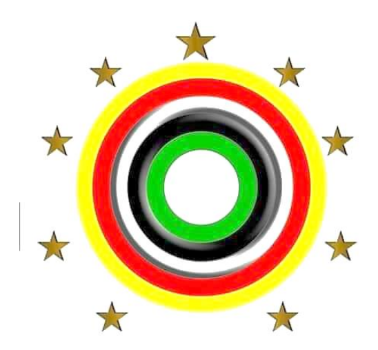
Picture 01. Coat of Arms and Logo of the Tawhid Study Council Tasawuf Abuya Sheikh Haji Amran Waly Al-Khalidi

The explanation of the meaning of the logo is as follows: