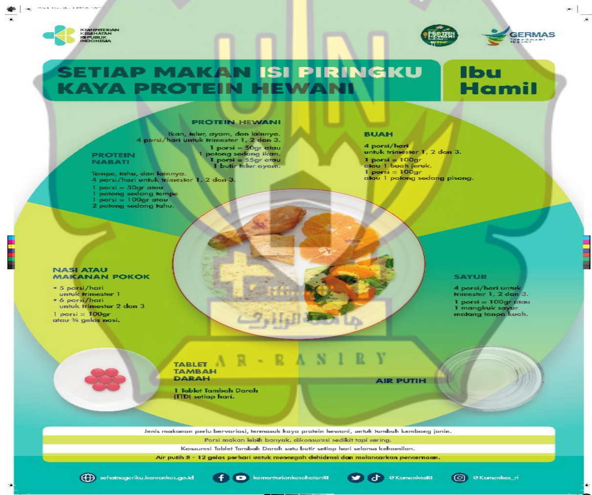
Figure 1. Foods Containing Protein Are Very Good For Pregnant Women Source: (kementerian kesehatan republik indonesia n.d.)

At the Sentosa Baru Community Health Centre, BOK management has been carried out through a series of formal stages based on technical guidelines, UKM meetings, joint implementation with nutritionists and cadres, SPJ recording, and monitoring through mini-workshops. The study concluded that the use of BOK has contributed significantly to stunting prevention (Salwa et al., 2024). The distribution of BOK funds is one of the government's responsibilities in health development for rural communities, particularly in improving promotive and preventive health efforts to achieve the Minimum Service Standards (SPM) in the health sector, as a benchmark for mandatory health affairs delegated by the government to local governments (Menteri Kesehatan RI, 2011). Citing page https://ayosehat.kemkes.go.id/1000-hari-pertama-kehidupan/home that there are foods containing protein that are very good for pregnant women, and these foods are: