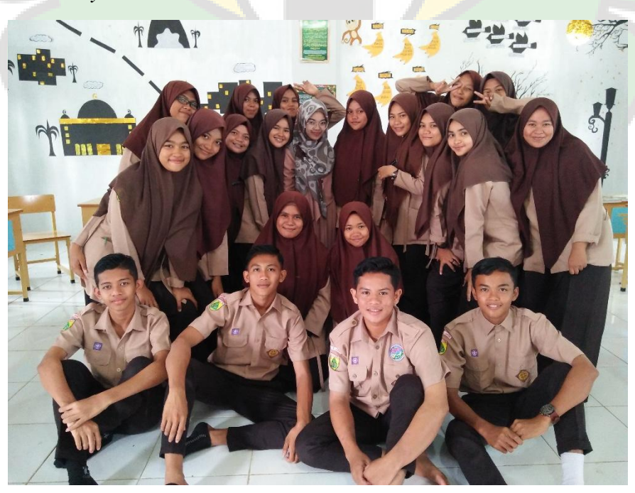
Picture 6. The researcher with the second grade of IPA1 students of SMAN Unggul Pidie Jaya.