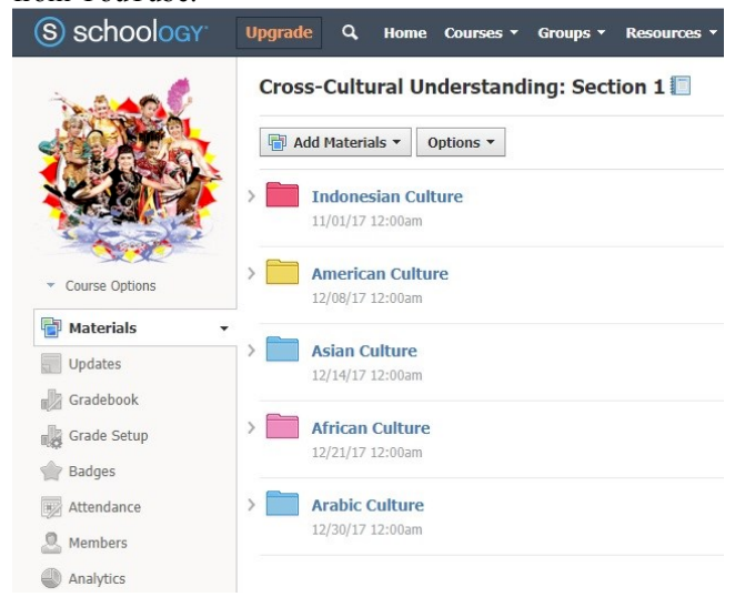
Fig. 2. Snapshot of five topics on the Schoology

The second step for the instructor is the uploading or transferring of video lessons and URLs onto Schoology LMS. In this phase, the instructor begins to create an account for Schoology and inviting students to access the site using a class code. Then, the students will be able to access the content on Schoology, watch online videos, read articles and view other sources outside of class hours, and according to their preferred times. The following Figures 3 exposes the content that has been transferred onto LMS Schoology including links to video, online discussion, and quiz and Figure 4 shows a pre-class video lecture adopted from YouTube.