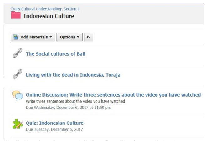
Fig. 3. Snapshot of content 1 (Indonesian culture) on the Schoology