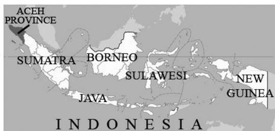
Location of Aceh

It was the closest point of land to the epicenter of the terrible 2004 Indian Ocean earthquake, which triggered a tsunami that devastated much of the western coast of the region, including part of the capital, Banda Aceh. The massive earthquake and tsunami killed 226,000 people ( Semangat , 2008). This deadly disaster helped peace initiators bring the warring parties, the Free Aceh Movement (GAM) and the Government of the Republic of Indonesia, to the negotiating table to end 30-years-war. Mediated by the former Finnish president Martti Ahtisaari the head of the Crisis Management Initiative (CMI) Agency the peace agreement, the Memorandum of Understanding, MoU Helsinki, was signed in Helsinki, Finland, on August 15, 2005. The end of long war accelerated the well-managed rehabilitation and reconstruction process and resulted in significant changes and continuous development in Aceh. The fast development remarkably impacts education including school management and leadership practices.