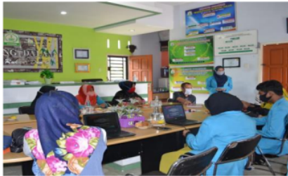
Fig. 2. Urban farming program socialization.