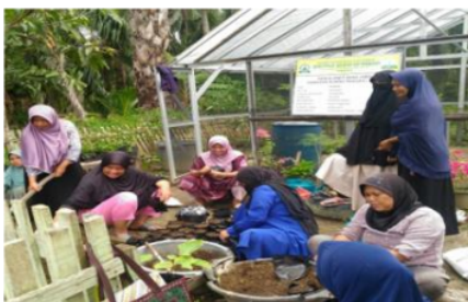
Fig. 3. Training on how to cultivate the urban farming model at the nursery.