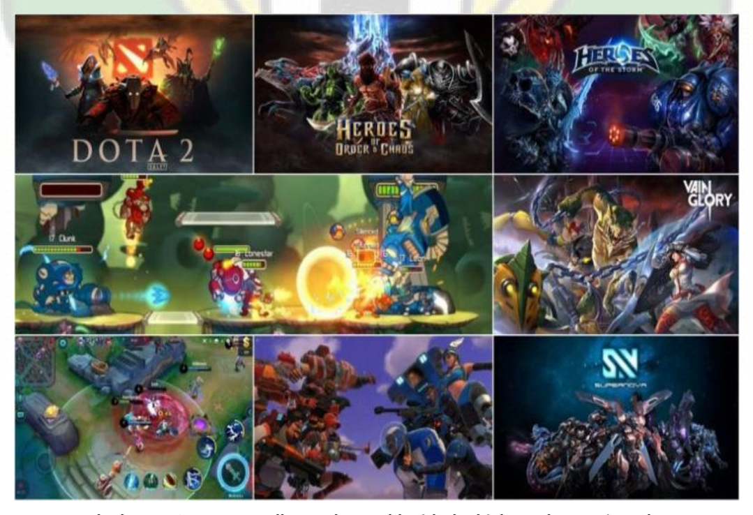
Figure 9 The best MOBA games all over the world with the highest players via webstore

Multiplayer online battle arena (MOBA) is a subgenre of strategy video games in which two teams of players compete against each other on a battlefield or battle arena. Each player controls a single character with a set of abilities that improve over the course of the game. The typical objective of this game is for each team to destroy their opponents main structure located in corner of battlefield. In some MOBA games, the objective can be to defeat every player on the enemy team. MOBA gained popularity in the 2010s as a form of electronic sports, encompassing games such as the Defense of the Ancients (DotA) mod for Warcraft III, League of Legends, Heroes of Newerth, Mobile Legend, Arena of Valor (AoV) and Vainglory.