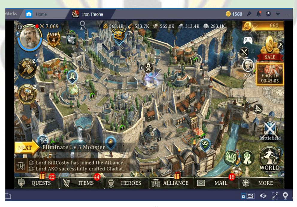
Figure 5 Age of Empire IV

A real-time strategy games is a type of games where players progress simultaneously with each other in "real time" as opposed to taking turns. The RTS genre typically describes games where players construct buildings and wield armies in order to dominate a field of play. Real-time strategy refers to a time-based video game that focuses on using resources to build units and defeat an opponent, where each player has time to carefully consider the next move without having to worry about the actions of his opponent. In real-time strategy games, players must attempt to build their resources, defend their bases, and launch attacks while knowing the opponent is scrambling to do the same things. An example of game is Age of Empire, StarCraft II, and Company of Heroes 3.