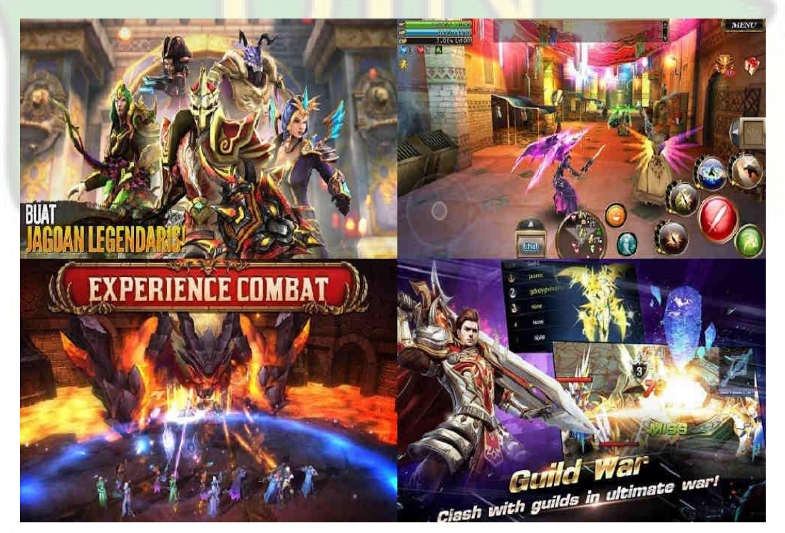
Figure 8 Top 4 MMO games that recommended by author

Massive multiplayer online games are games which a large number of people can play simultaneously, MMO were made possible with the growth of broadband Internet access in many developed countries, using the Internet as a main source to allow thousands of players to play at the same servers together. Many different styles of massively multiplayer game are available, but the most popular games that play among the players are MMORPG (Massively Multiplayer Online Role-Playing Game).