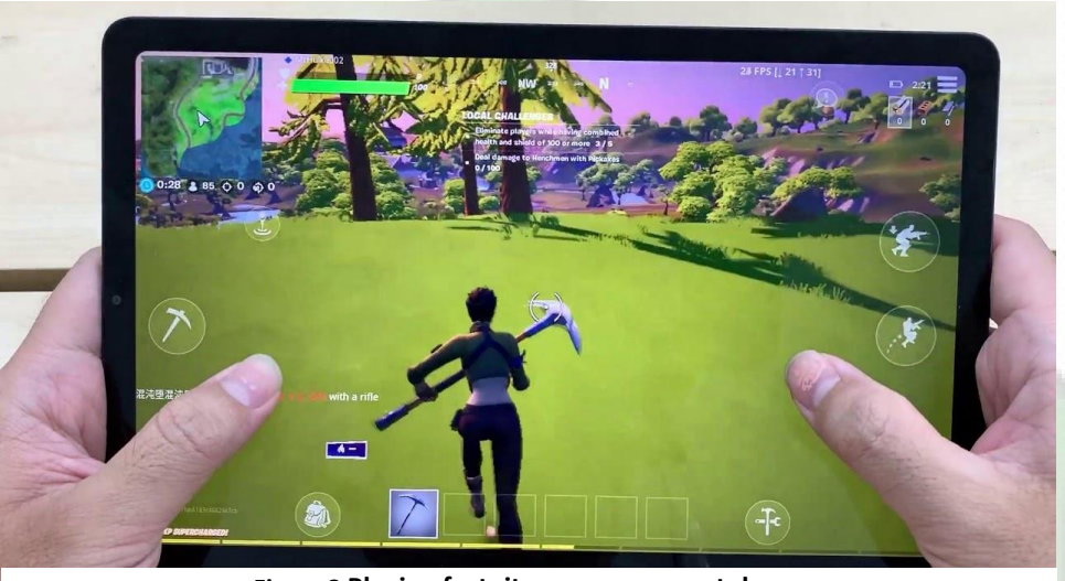
Figure 3 Playing fortnite game on smartphone https://www.youtube.com/watch?v=h4BCVPl9txY

The game platform that is currently grown very popular is mobile games. Mobile game is a game that is played on a mobile device like smartphone and tablet. Even though mobile games are not as great as PC games or consoles, mobile games are in demand because of the ease of accessing games and almost everyone has a smartphone or mobile phone right now. Mobile games are usually downloaded in the app store for users of the IOS operating system, and play store on the "Android" operating system.