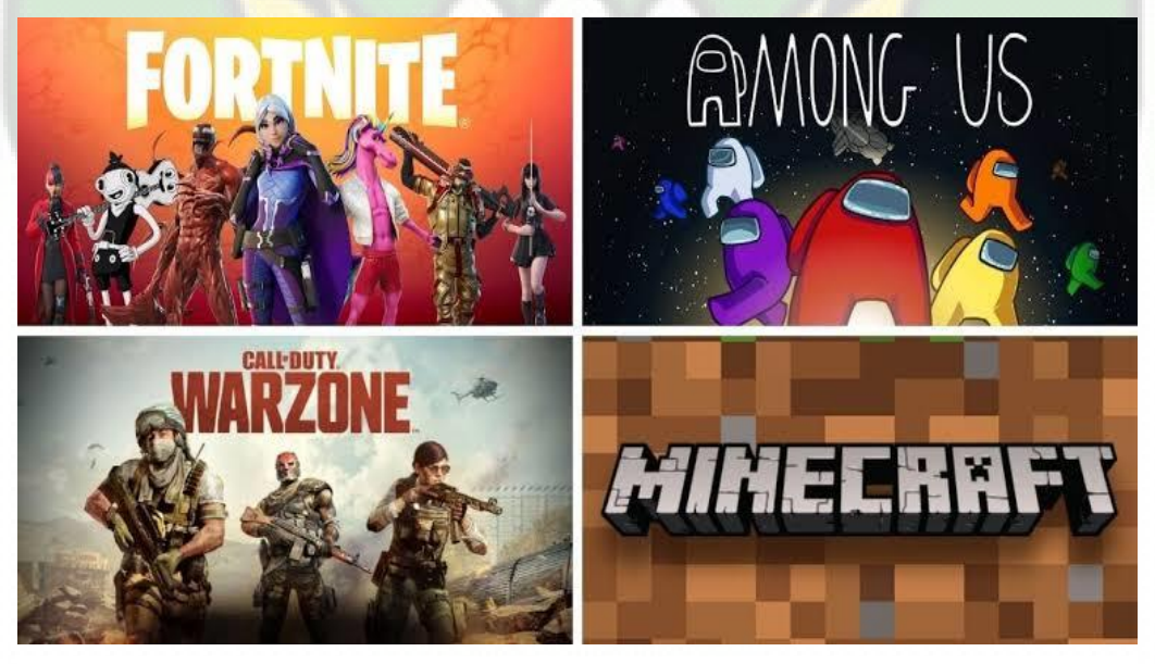
Figure 6 Most popular cross platform online games

Cross-Platform Online is a game that can be played online with different hardware and devices. Basically, to play the games the device needs to connect through the internet. The terms of cross platform online games is refers to a games that are available across many different platforms and all of the players can play in multiplayer mode with any user online, no matter which device and console they use. For example MineCraft, Need for Speed Undercover, and fortnite can be played online on the computer and the Xbox 360 (Xbox 360 is a hardware or console game that have connectivity to the internet so that you can play online).