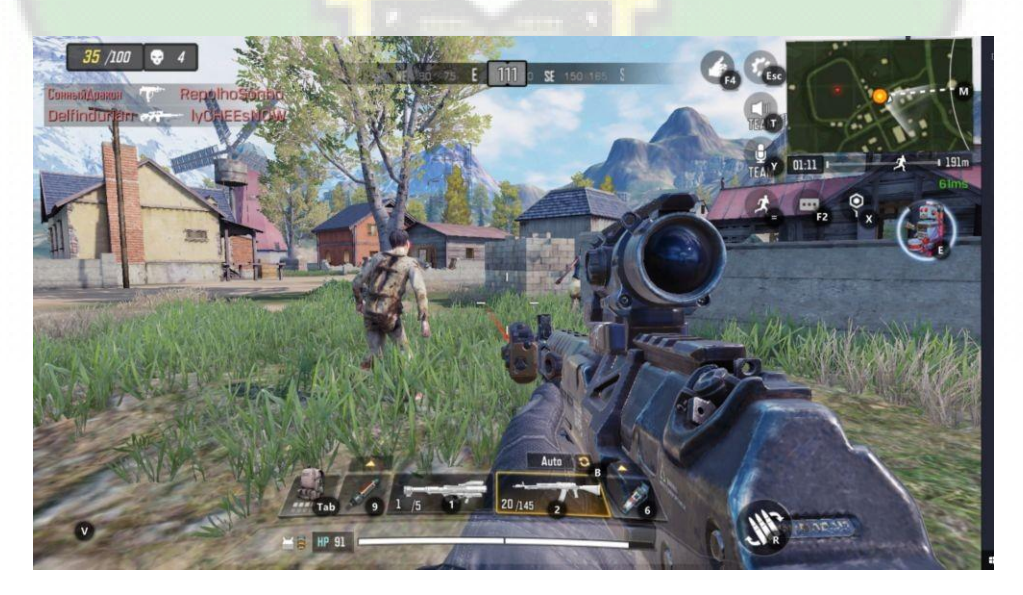
Figure 4 Call of duty game https://ruanglaptop.com/game-fps-android/

First-person shooters are the types of shooter game that relies on a firstperson point of view in which the player experiences the action through the eyes of the character. FPS games can be played in two general modes; mission or quest mode and multiplayer mode. The mission mode is usually designed for a single player, while the multiplayer mode involves multiple gamers participating via a network and playing in a shared game environment. Example of the video game is Point Blank, Cross Fires and Valorant.