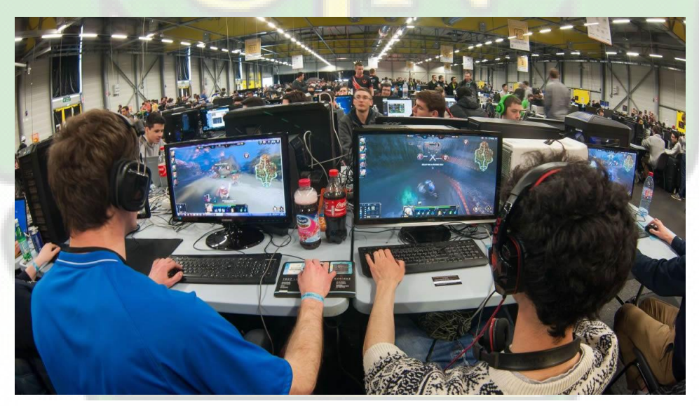
Figure 1 Some player who playing computer games in warnet

https://www.trentech.id/trik-cara-main-game-berat-di-pc-kelas-bawah/