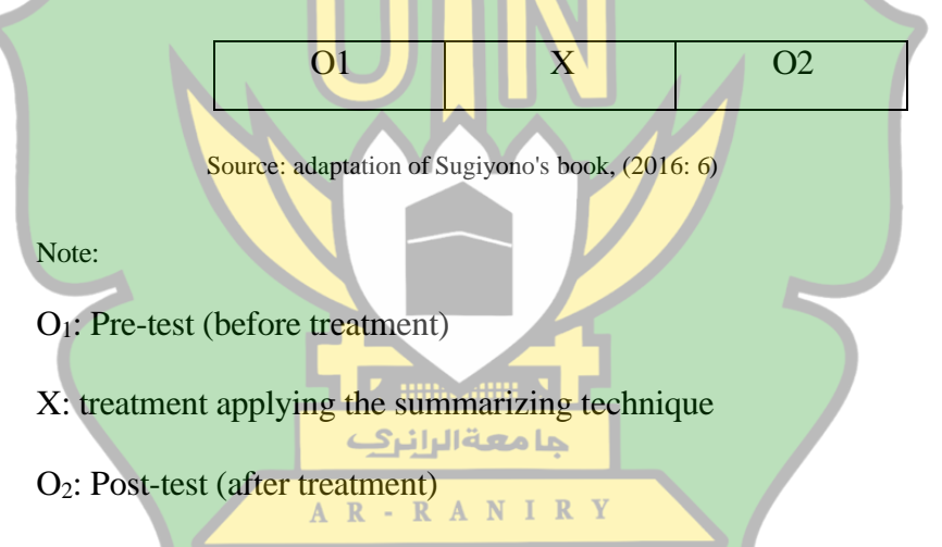
Table 3.1. Pre-experimental to one group of Pre-test and Post-test

Based on the explanation above, in carrying out the One Group Pre-test-post-test-test Design experimental research by giving tests before giving treatment (pre-test) to determine student learning outcomes. After that, treatment was given by applying the summarizing technique. Then, after being given the treatment, a test is given to measure student learning outcomes after being given treatment (post-test). This study used the summarizing technique to determine whether there is an influence and to improve their understanding of how it affects students' writing abilities.