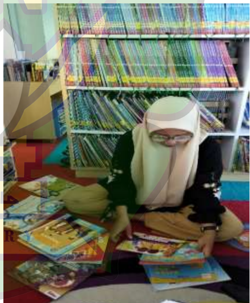
Gambar 7 dan 8 Wawancara dengan pustakawan ruang deposit Observasi koleksi buku cerita bergambar