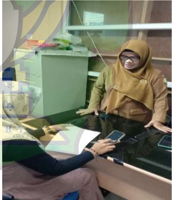
Gambar 4 Wawancara dengan Pustakawan Ruang Deposit