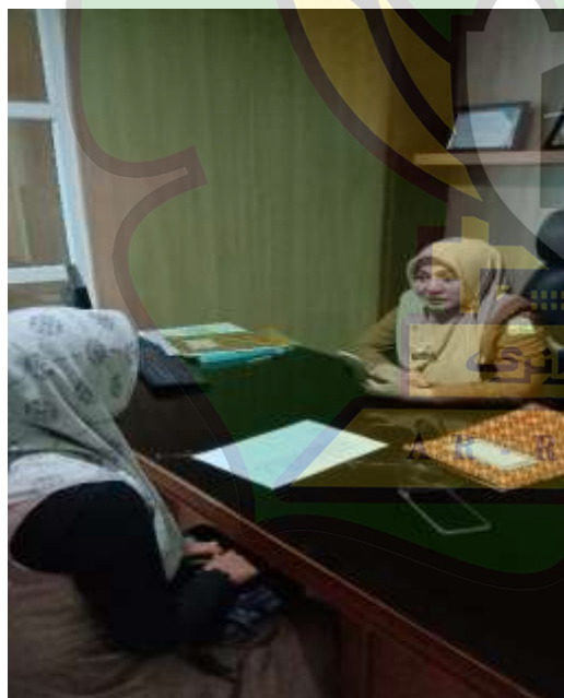
Gambar 3 Wawancara dengan Kasi Layanan Pustaka

Wawancara dengan pustakawan ruang anak dinas perpustakaan dan kearsipan Aceh