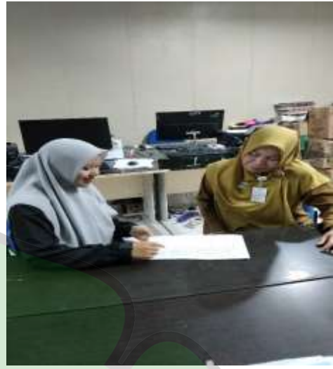
Gambar 5 dan 6 Wawancara dengan Pustakawan Ruang Deposit