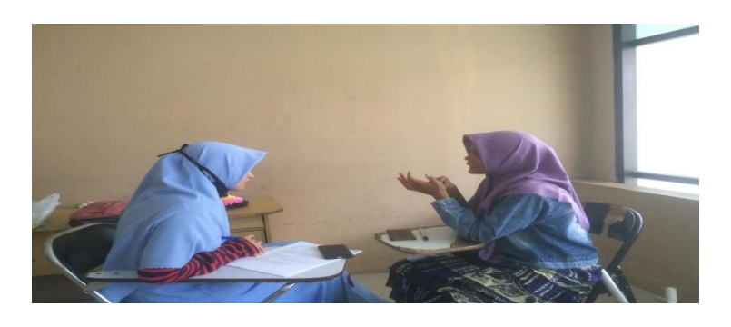
Interview with P2