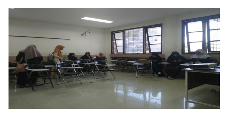
D1 Observation class