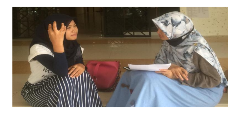
Interview with P5