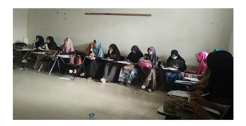
D2 Observation class